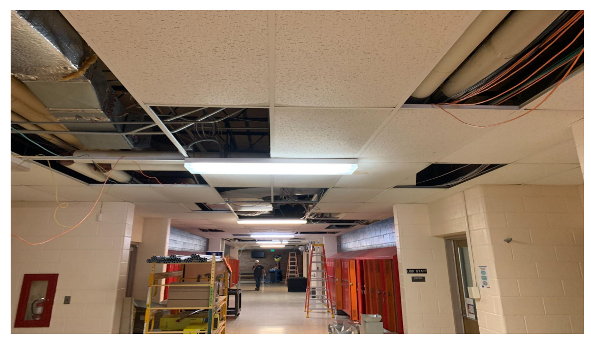
VRV and ductwork is progressing. 80% of rooftop units are disconnected and new conduit and wiring replacement has begun

CHS Addition Project: The foundation and storm sewer work is progressing along with the completion of the retention pond. There will be two new walking paths put in for football/track spectators along the fence at Wegner Stadium and between the baseball/softball complex. There are also new traffic patterns as well as additional temporary parking on the east side of the existing building.