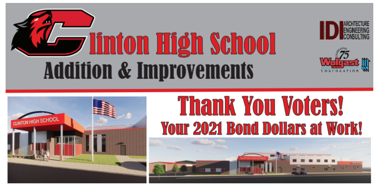
We want to again thank voters for supporting the bond . Your investment in our facilities will pay dividends for our students, families and the entire community for decades to come.