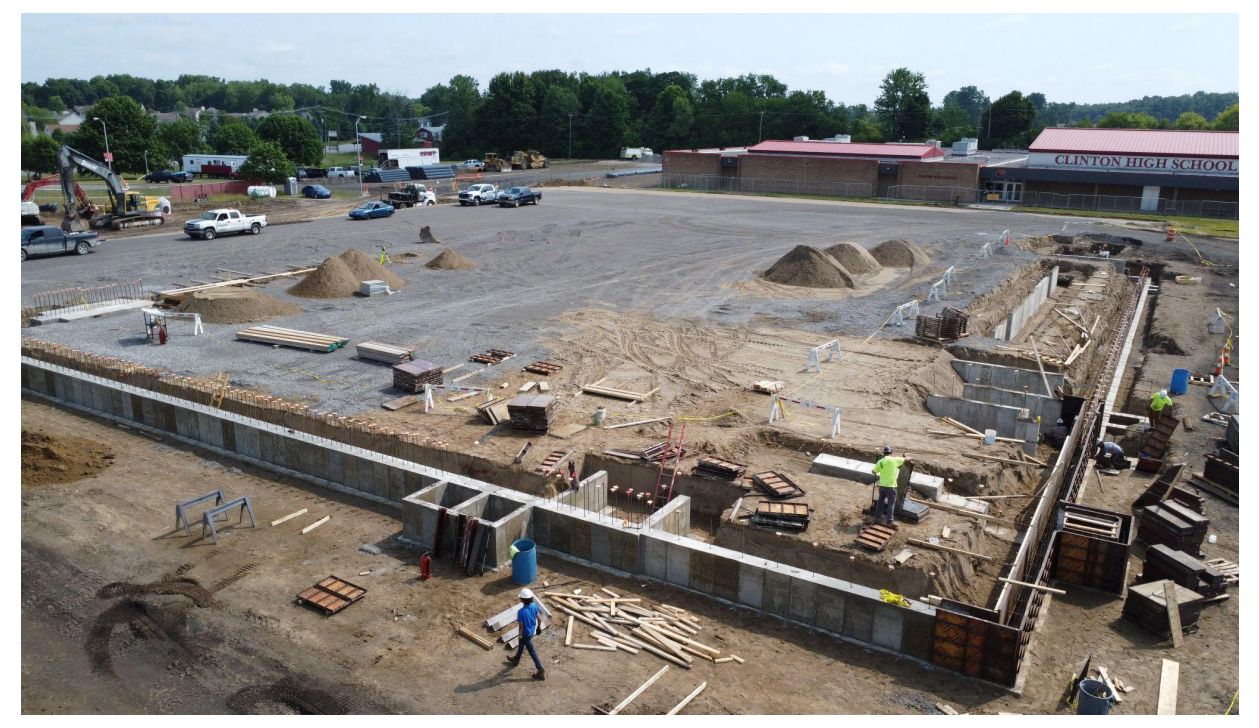
View from the West masonry contractor, with the gym wall block starting.