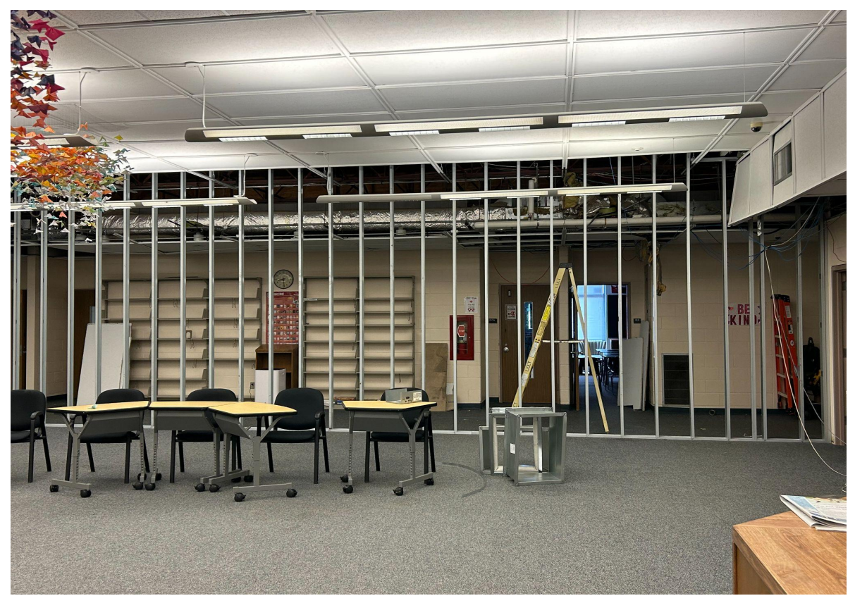
Wall/Hallway being added separating 2 buildings